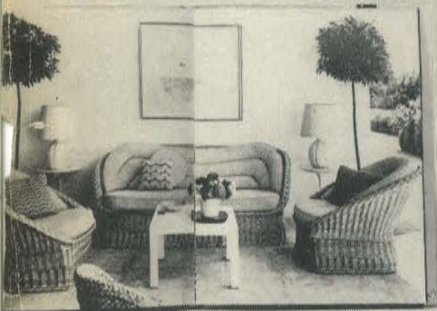
Fabrics and papers by Woodson Wallpapers; furniture by LCS. All available through decorators. Room photographed at the Galleria condominium, New York. Shopping information, page 154.